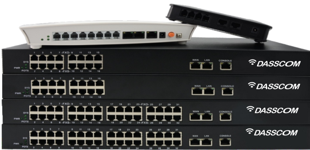
Dasscom DS Series Models