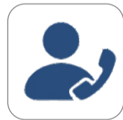
Advanced Call Features