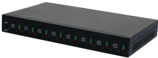
DWG2000E-8G/C (Standalone Antennas )