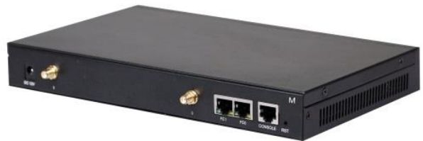
DWG2000E-8G/C-M (Built in 4-1 Antenna Power Divider )